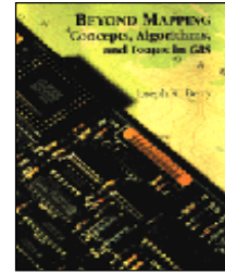
Beyond Mapping book

Imagination is More Important than Information — describes procedures for characterizing surface configuration (slope, aspect and profile)